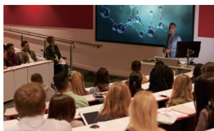
For academic use