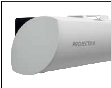
Leaf shaped case design