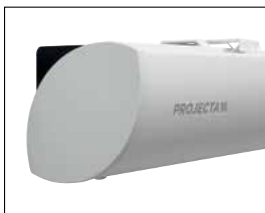
Leaf shaped case design